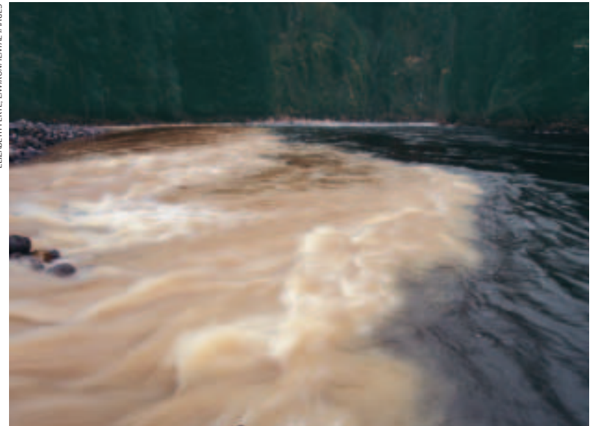
Heavy logging has soiled Fish Creek, a tributary to the Clackamas River on the Mount Hood National Forest.

disease. Muddy water forces some municipal water systems to shut down completely.