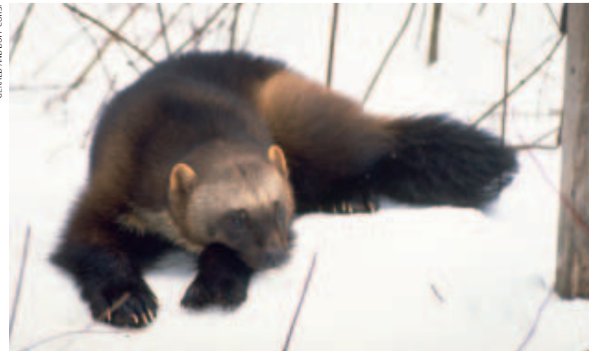
Wolverines ( Gulo gulo ) do not get along well with people or development.

Cougar In Oregon, cougar or mountain lion are the most common names for Puma concolor . Since the species originally had the widest range of any mammal in the Western Hemisphere, it also picked up some other names, including puma, catamount, panther and painter.