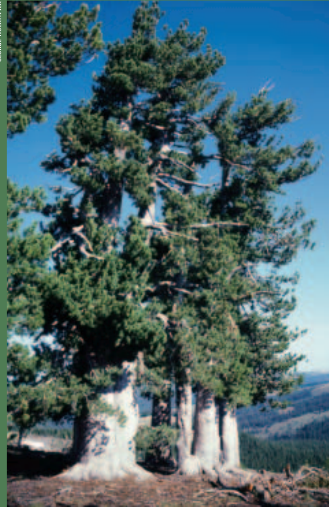
Whitebark pine ( Pinus albicaulis ) on the Fremont National Forest.

In a few cases, killing competing tree species may encourage whitebark pine growth, but this is not economically feasible. In some places rust-resistant seedlings grown from local stock are being planted. However, planting is best done indirectly by letting Clark's nutcrackers distribute the seed. The birds instinctively know better (even if they don't know so) than humans (even if they think so) as to where the trees should be planted.