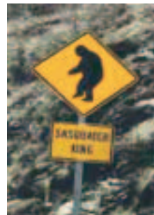
Although it has been given a scientific name ( Gigantopithecus americana ) Bigfoot or Sasquatch probably doesn't exist. However, it might.

—Wendell Berry (quoting his daughter in his poem, "To the Unseeable Animal") 36