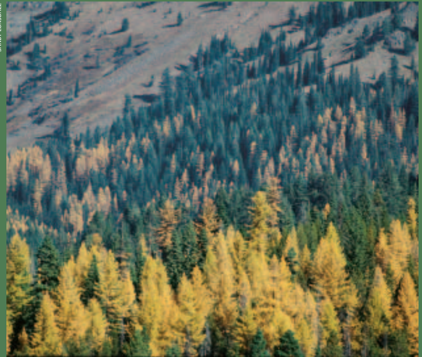
Western larch ( Larix occidentalis ) on the Wallowa-Whitman National Forest. The larch has a contrary nature as a deciduous conifer. After turning color in the fall, the needles fall off.

The utility of the western larch is not limited to its beauty. Rotting cavities within larch trunks provide homes to several songbird species, woodpeckers, owls and flying squirrels. Occasionally osprey, bald eagle and even Canada geese make their large platform nests in western larch trees. Both blue and spruce grouse eat the buds and leaves. Black bears favor larch trees for escape because the textured bark and large size make for easy climbing (if one is a bear).