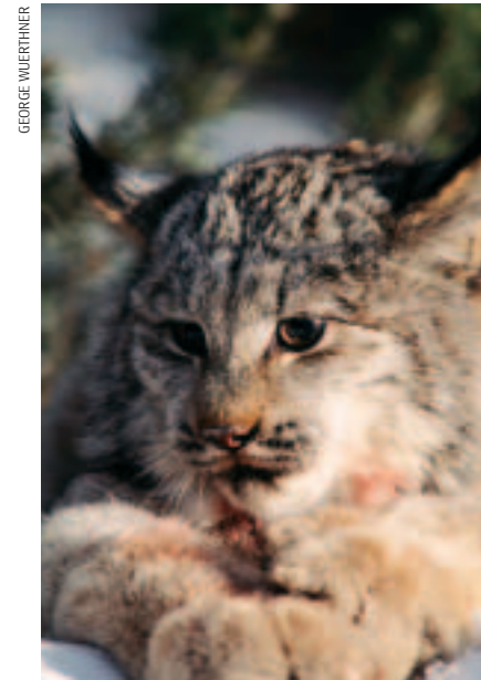
The large paws of the lynx ( Lynx Canadensis ) allow them to hunt atop heavy snow. The blood is not lynx blood.

Lynx Lynx canadensis was thought to have been extirpated from Oregon, but it turns out that the species is just very rare and, until now, hard to detect. Over the last several decades there has been a string of credible lynx sightings from south of Crater Lake all the way to the Wallowa Mountains. Adding to the sightings, the lynx's