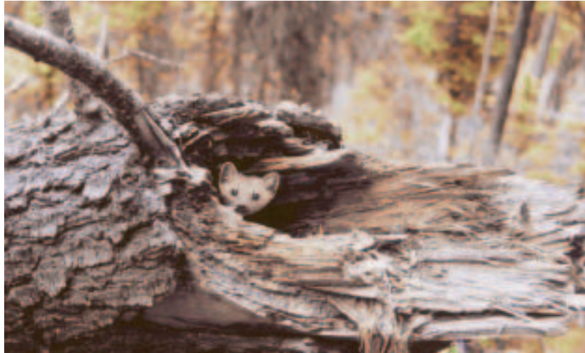
The American marten ( Martes americana ) needs mature closed-canopy forests.