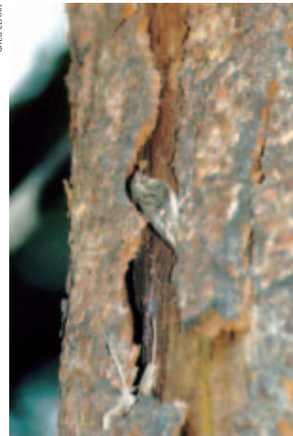
The brown creeper ( Certhia americana ) specializes in exploiting the short period in the life of a snag where the bark is beginning to fall off, but hasn't quite.

enough bark-sloughing snags for brown creepers.