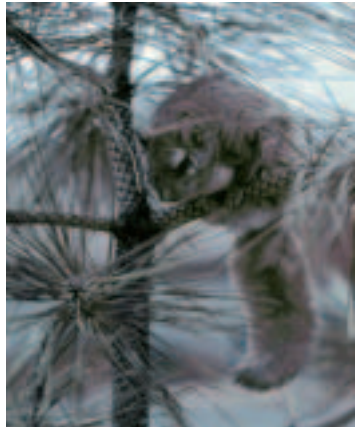
Northern flying squirrels ( Glaucomys sabrinus ) do not actually fly, but do glide between trees using a flap of skin that extends between their front and rear legs. They mostly eat underground fungi and are mostly eaten by northern spotted owls.

Approximately 579 wildlife species are regularly found in Oregon, including 31 amphibians, 31 reptiles, 370 birds and 137 mammals. Many of these species are in trouble. In Oregon, 139 vertebrate species (most species are invertebrates) are categorized as “endangered,” “threatened” or “sensitive.” This means that their populations are neither stable nor increasing — as a matter of scientific, if not legal, determination. As of 1996, this list included 36 fish, 19 amphibian, 8 reptile, 54 bird and 22 mammal species. Not included are the grizzly bear and other species that have been extirpated from Oregon.