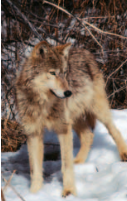
The gray wolf ( Canis lupus ) was once common in Oregon, then was extirpated and now is moving back into the state from Idaho.

The largest canid in the world, the gray wolf once ranged across the continent from the central plateau of Mexico to the lower Arctic and from coast to coast. Usually gray, the wolf can also be yellowish or light brownish with black. Two subspecies historically ranged in Oregon. The smaller, darker C. l. fuscus was found in the western three-fifths of the state while the lighter, larger C. l. irremotus was found elsewhere.