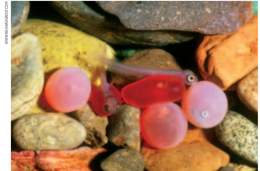
Coho salmon ( Oncorhynchus kisutch ) eggs and alevins (more than just an egg, but not quite a fry) need clean and gravelly stream bottoms.

understory also reduces pine seed production. Livestock grazing also removes grass that carries these beneficial fires. As an increasing shrub and tree layer replaces the open forest floor, predation by small mammals of white-headed woodpecker nests increases.