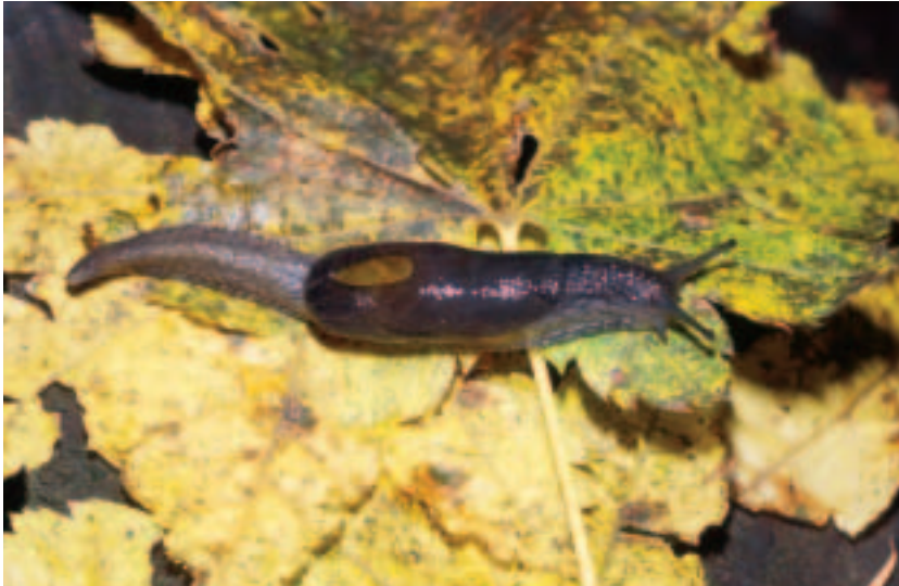
The Malone jumping slug ( Hemphilla malonei ) is only found in older forests.

Mollusks in Pacific Northwest forests can number 4.5 million per acre and, merely by eating, are responsible for recycling up to 90 percent of the biomass in a forest. Because they tend to have very exacting ecological needs and because they are rather small and very slow, Northwest forest mollusks don't disperse well. Imagine being an inch long with one foot and trying to cross a 40-acre clearcut to get to "greener pastures."