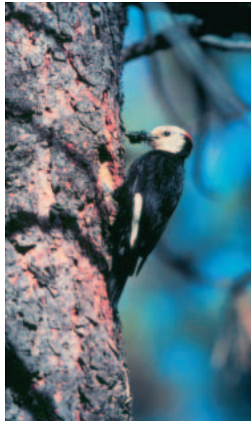
In Oregon, the white-headed woodpecker ( Picoides albolarvatus ) has a strong affinity for ponderosa pine.

The more old-growth ponderosa pine there is, the more white-headed woodpeckers there are. Unfortunately, ponderosa forests have become one of the most endangered forest types in the West. Ponderosa pine forests have been dramatically reduced by logging, and fire suppression has curtailed the low-intensity ground fires that burn out the young trees under the big old pines. The result of fire suppression is that fir forests grow up underneath and eventually replace the pine forests. Competition from this