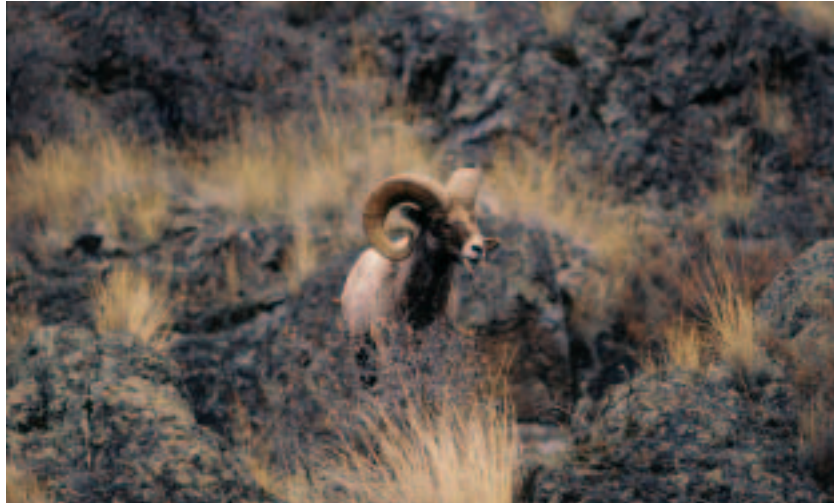
Rocky Mountain bighorn sheep ( Ovis americana americana ) are often fatally susceptible to diseases from domestic sheep.

In 1971, twenty Rocky Mountain bighorns were transplanted from Jasper Park, Alberta to Hells Canyon, but they eventually disappeared. Another twenty were released the same year on the Lostine River in the Eagle Cap Wilderness. Fortunately, that population thrived and became the source of successful transplants elsewhere in Northeastern Oregon (including Hells Canyon) and other states. Today, Oregon has an estimated 700 Rocky Mountain bighorn sheep.