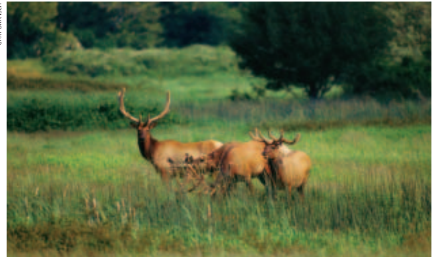
Roosevelt elk ( Cervus elaphus roosevelti ) are found west of the Cascade Crest.

that had been decimated by commercial hunting (some for the meat, mostly for the hides, antlers and upper canine teeth) and competition from livestock grazing.