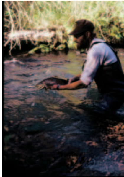
Bull Trout ( Salvelinus confluentus ) require cold, clear water and are an excellent indicator of watershed health.

Bull trout have three major life histories. Resident bull trout permanently reside in their natal streams. Fluvial runs migrate from the smaller tributaries where they spawn and rear as juveniles to larger streams where adults forage and live for the majority of their lives. Adfluvial runs are similar to fluvial runs except that adult rearing occurs in lakes or reservoirs.