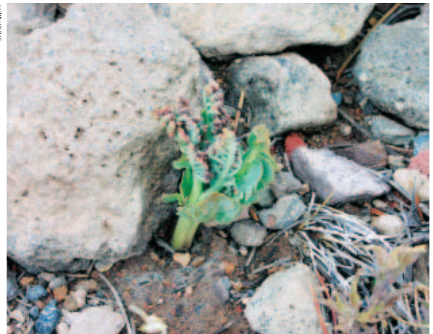
A stronghold for the pumice grape fern ( Botrychium pumicola ) is the proposed Newberry Volcano Wilderness.