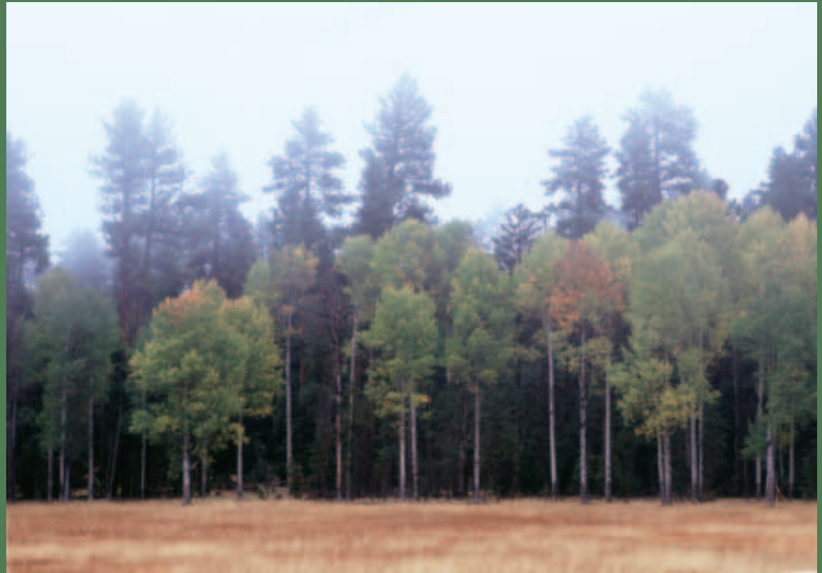
Quaking aspen ( Populus tremuloides ) (foreground) and ponderosa pine ( Pinus ponderosa ) (background) on the Ochoco National Forest.

In the American West, the original 9.6 million acres of quaking aspen is down to just 3.9 million acres. In Oregon's Malheur National Forest, aspen have been reduced by 80 percent from historic levels from livestock grazing. While domestic livestock are unquestionably a large part of the problem, another culprit is Smokey Bear.