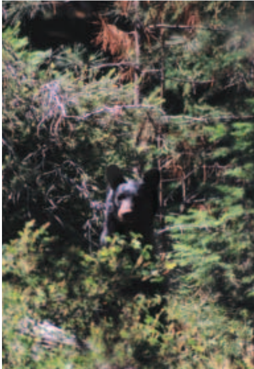
Black bears ( Ursus americanus ) prefer dense conifer-deciduous forests, but will munch on the cambium layer of little trees in timber plantations (since there is little else around). Consequently, the timber industry advocates severely reducing their numbers.

tree. And the large, living tree must first have been allowed to grow into an old tree, at least 150 to 200 years. In northeast Oregon, top-entry bear den trees average 57 feet in height (the tree was once taller) and over 43 inches in diameter at the base. Grand fir, western larch and western redcedar provide the best dens. While subject to heart rot, western white and lodgepole pines, Douglas- and subalpine fir and Engelmann spruce seldom form hollow chambers needed by bears.