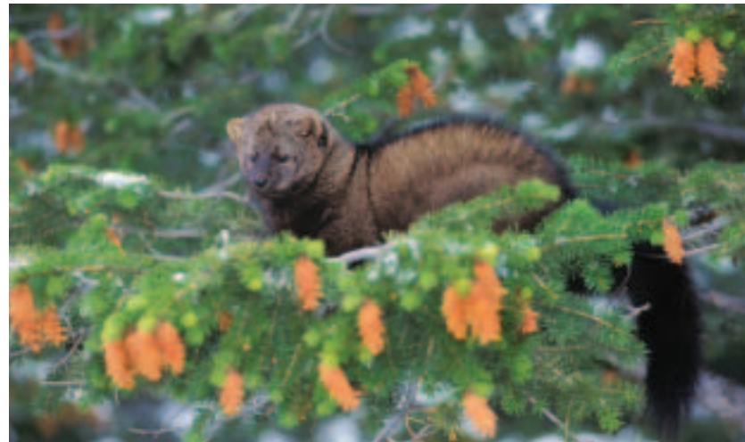
Very rare in Oregon, the fisher ( Martes pennanti ) has been the victim of trapping and habitat loss. It needs dense, mature forests with a deciduous component.