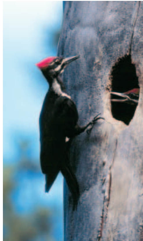
The pileated woodpecker ( Dryocopus pileatus ) requires trees at least 70 years of age for nesting.

large snags (standing dead trees) and downed trees to remain in forests. We must also allow very large old trees to die naturally and become large snags and/or downed trees.