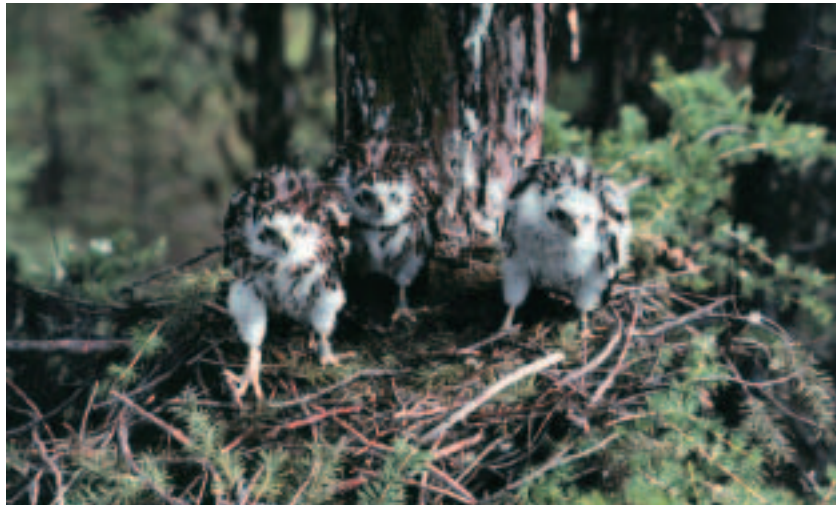
Northern goshawk ( Accipiter gentilis ) nestlings. This species prefers big trees and open understory.

Seeing a goshawk is a rare treat because of its reclusiveness and specialized habitat requirements. A pair of goshawks builds and maintains three to nine nests each year, but only defends one nest each year. The others are free for use by northern spotted owls, great gray owls, great-horned owls, short-eared owls, Cooper's hawks, red-tailed hawks, squirrels and many other species.