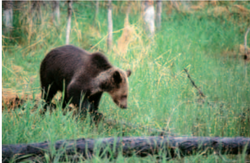
The last grizzly bear ( Ursus arctos ) in Oregon was shot in 1931. It is possible that they are returning to the state from Idaho.