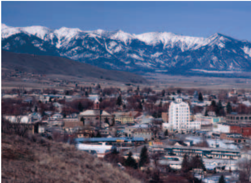
Baker City gets its drinking water from the Elkhorn Mountains in the proposed North Fork John Day-Elkhorns Wilderness.