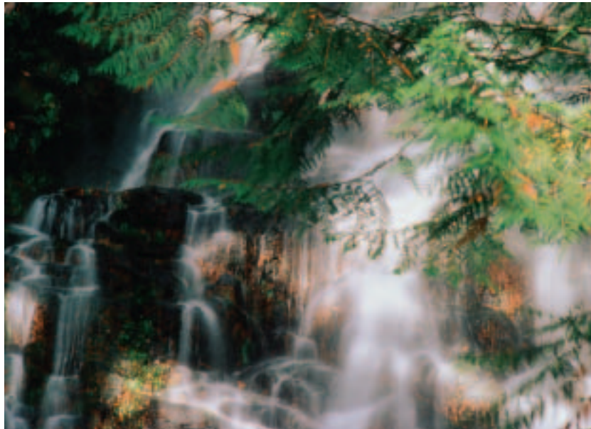
The vast majority of Oregonians get most of their drinking water not from groundwater, but from surface sources.